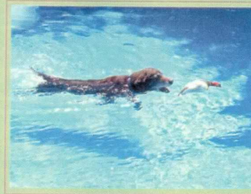
Sandi, 8 yrs, fostered on LI/adopted CT Cleo,10yrs,military surrender, fostered/adopted